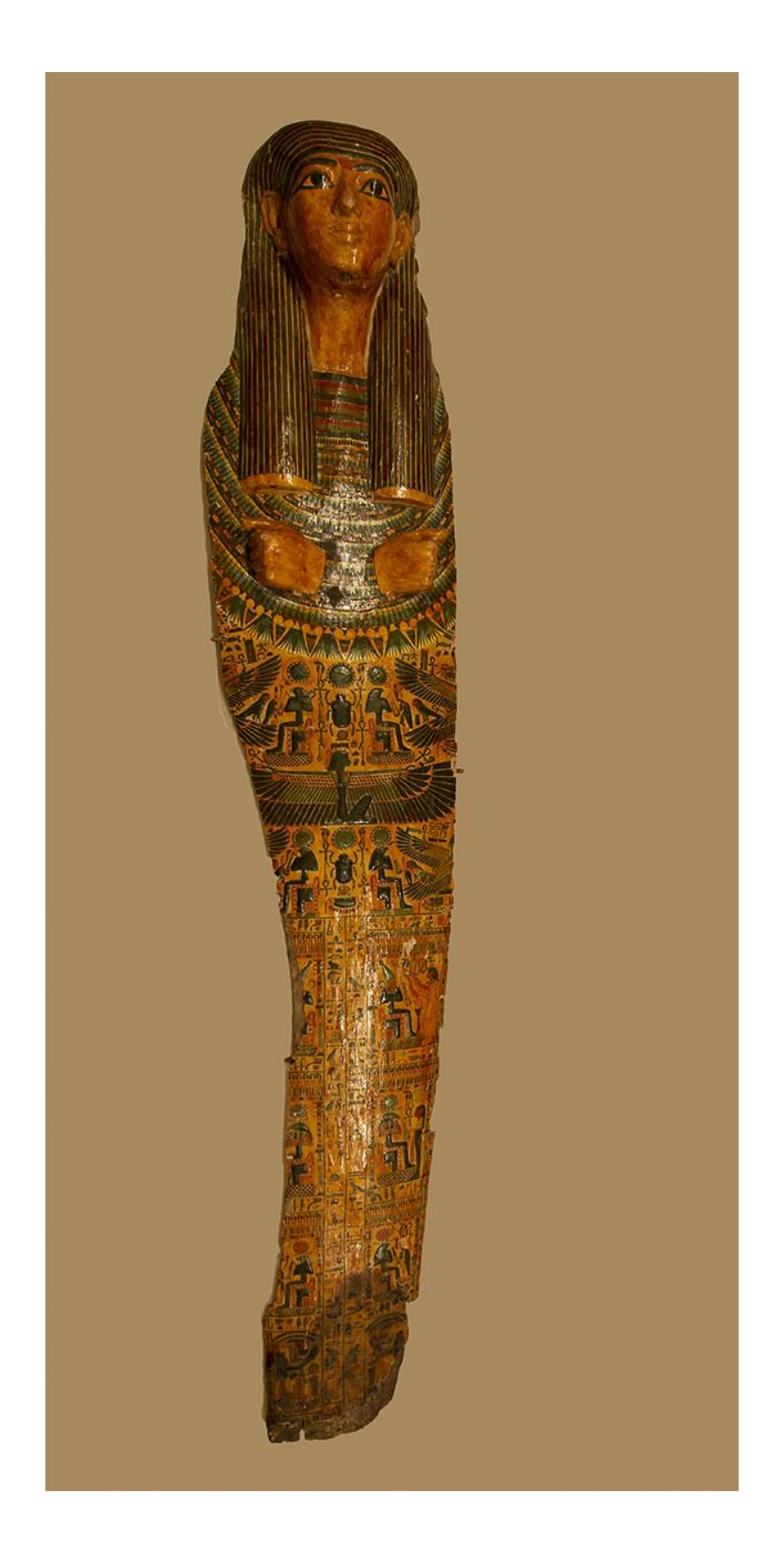
Fig. 1: Mummy-cover