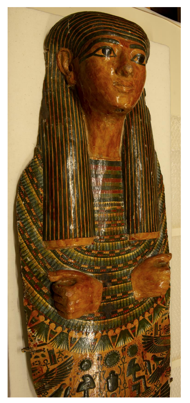
Fig. 2: Mummy-cover Headboard and upper section