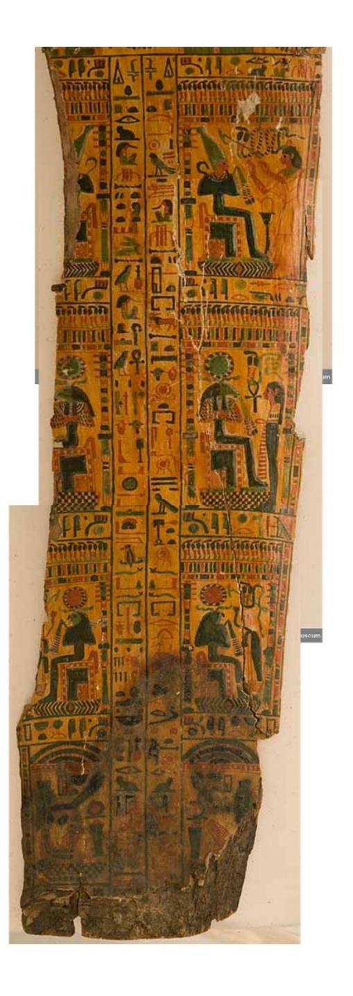
Fig. 6: Mummy-cover Inscriptions