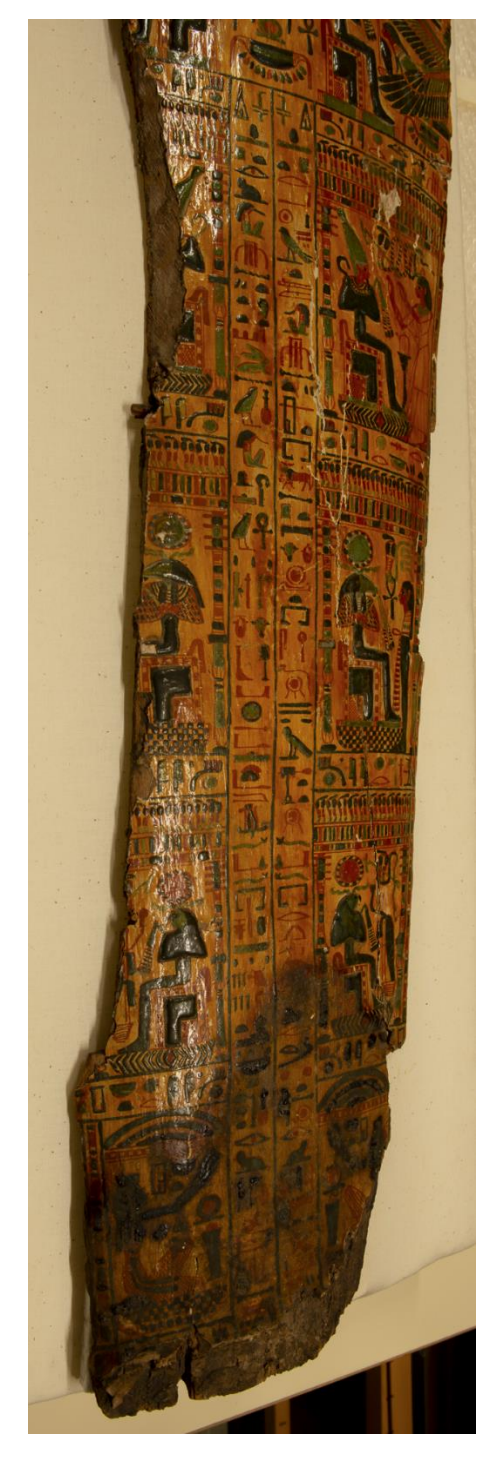
Fig. 4: Mummy-cover Lower section