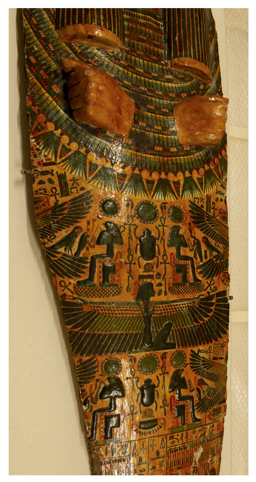
Fig. 3: Mummy-cover Central panel