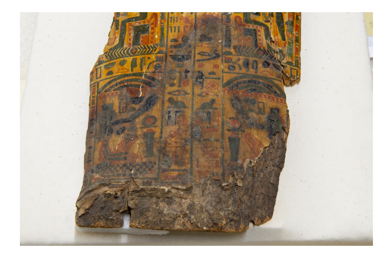
Fig. 5: Mummy-cover Footend